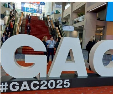
Govt. Affairs Conference | March 2-6