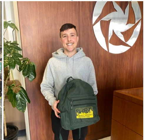
NERT Webinar Go Bag Winner | February 18