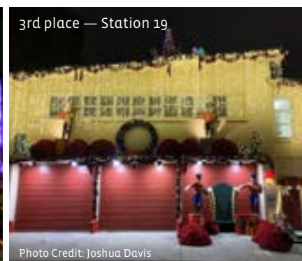
3rd place — Station 19