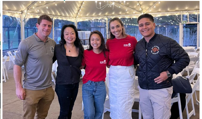
SF Firefighters Local 798 Toy Program Golf Tournament | Oct 21