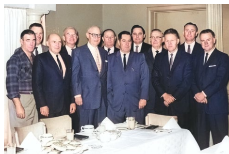
Board of Directors (1960s)

Stay tuned as we celebrate this milestone with you throughout the year!