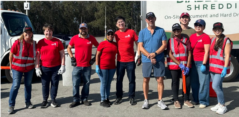
Shred Day | Sept 26