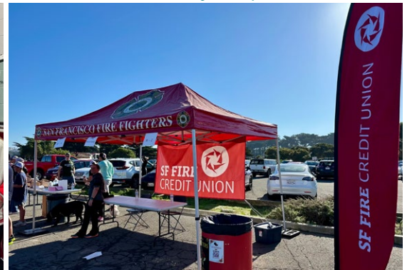
43rd Annual SFFD Turkey Trot | Nov 22