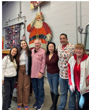
43rd Annual SFFD Turkey Trot | Nov 22