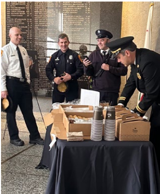
Suppression Class 136 Graduation Day | Dec 19