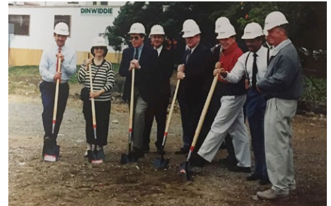
California Street Branch Groundbreaking