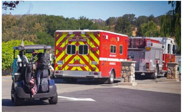
Steven L. Rucker Golf Tournament | May 23rd