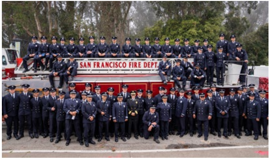
SFFD Graduation, 129th Class | June 3rd