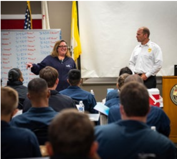
129th Class, Lunch & Presentation | June 2nd