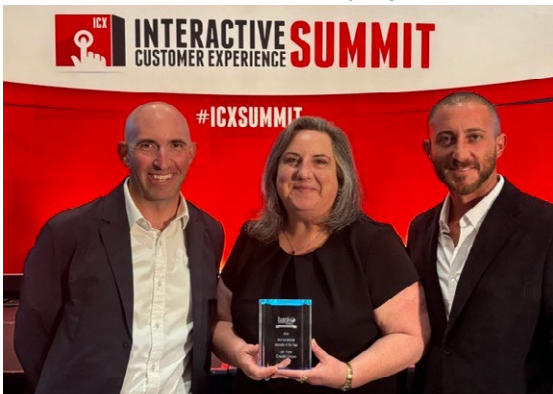
Innovator of the Year Award for our Stonestown Remodel | Sept. 9