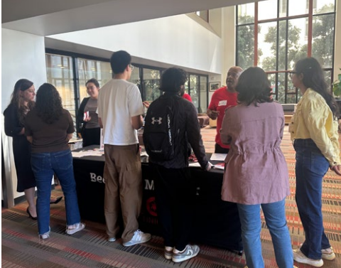
UC Davis Orientation | Aug 22