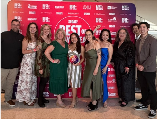
SFGATE's Best of the Bay Area Awards | July 26