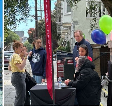
Park Branch Library Open House | Aug 9