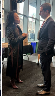
Marin Food Bank | Sept 16