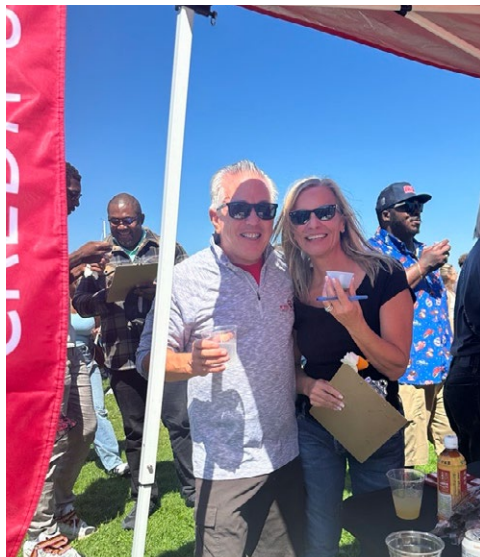
SF Firefighters 18th Annual Chili Cook off, Sept '25