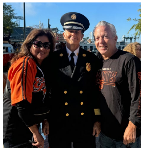
Giants Firefighter Appreciation Tailgate, Aug '24

"It's such a small world to realize how connected we are in San Francisco, and to travel across the world to a small island in Italy and meet people who have connections with the SFFD simply because they recognized the SFFD emblem. We really are just one big community."