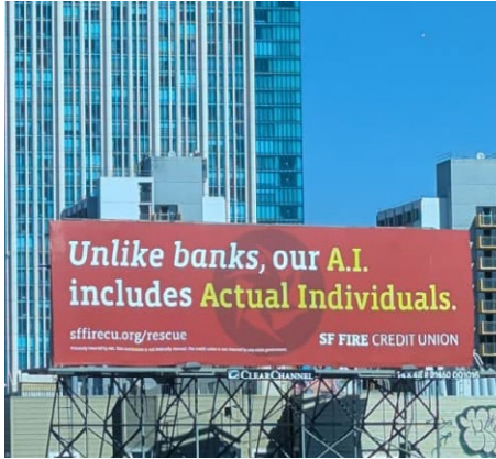
SF Fire Billboard | July 31